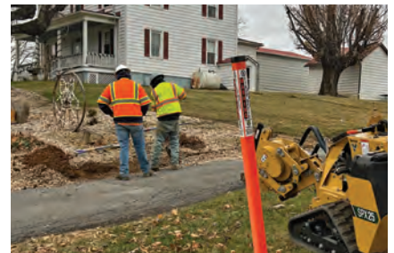
Crews install fiber in Middlebrook, Va.