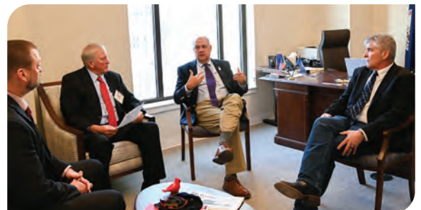
BARC leadership advocates for members during a meeting with Del. Chris Runion.

Through a strong showing of unity around our legislative agenda, cooperatives can speak with one powerful voice in the halls of government.