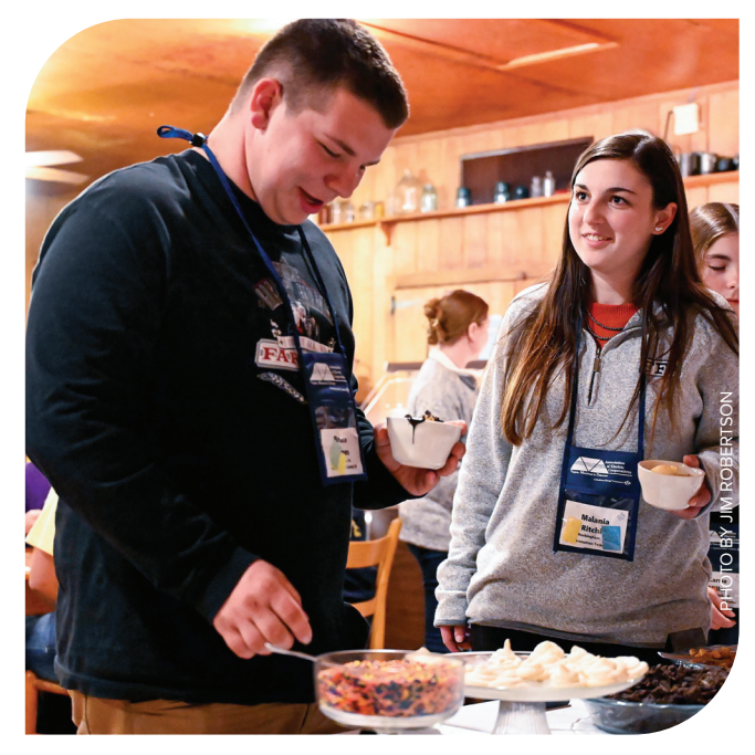
Students enjoy the ice cream social at the 2023 VICE Conference.

Questions about the application process can be answered at vmdaec.com/scholarship.