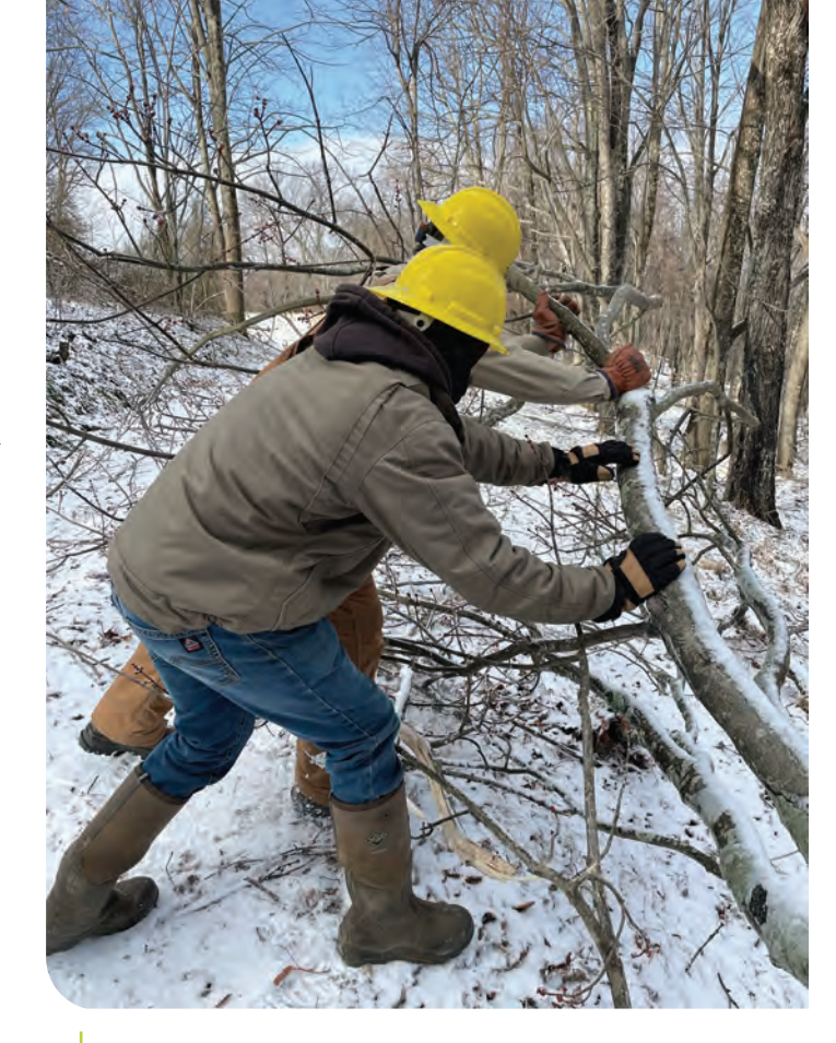
A BARC crew removes fallen limbs prior to beginning work to restore power during Winter Storm Elliott.

During the 24th, a new set of issues became apparent as many households started to look to supplemental electric heat to combat the frigid temperature with normal heating systems struggling to keep up. This resulted in a multiple circuits experiencing multiple overloaded protective devices causing momentary power outages aka blinks. BARC, and almost every other utility in the region, made a callout to our members to conserve energy to limit overloads. By 4:30 p.m. on the 24th, we had restored 100% of our members affected by the event and all personnel were sent home to spend Christmas Eve with their families or loved ones.